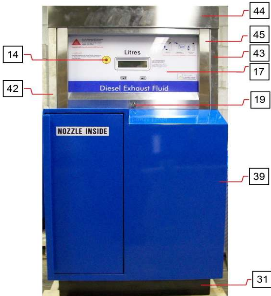
Fig.1 - DEF-200-X External Components Front View